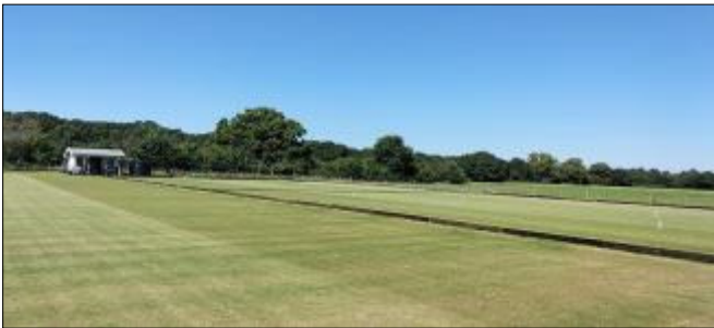
4 brand new courts on Bucklesham Road

For more details telephone ; 07944 205 065, website ; ipswichcroquetclub.com