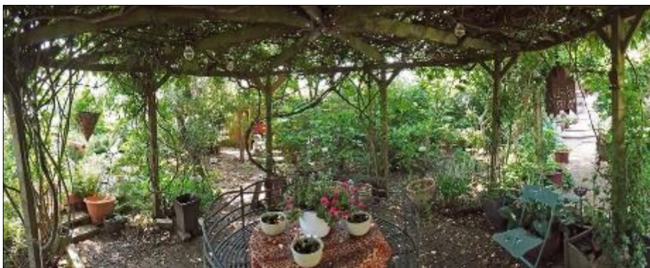
Panoramic view of a secret garden,