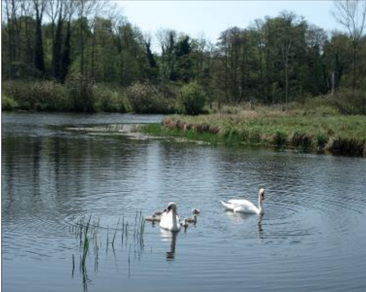
The Mere, Hill Farm, Playford

Two years after moving to Playford in 2006 we decided that the time had come to get another dog but before doing so, I started to walk the area and discovered just how blessed we are in our four villages from which emanate a large variety of wonderful walks - no need to get into a car.