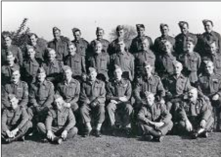
Bealings Home Guard - together in time of war. Now – together in time of peace.

having a major input from the perspective of Little Bealings, so this is very much a project that sees the two villages as one entity, with so many shared enterprises over the course of time: the Village Hall, the WI, the Home Guard, Scouts, Church Choir, Quoits, Drama – to say nothing of the ways in which families have criss-crossed across the two villages. Both Parish Councils are fully supportive of the project.