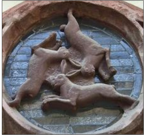
Ancient Triskele Symbol

are numerous occurrences of the symbol in churches, especially in the Southwest.