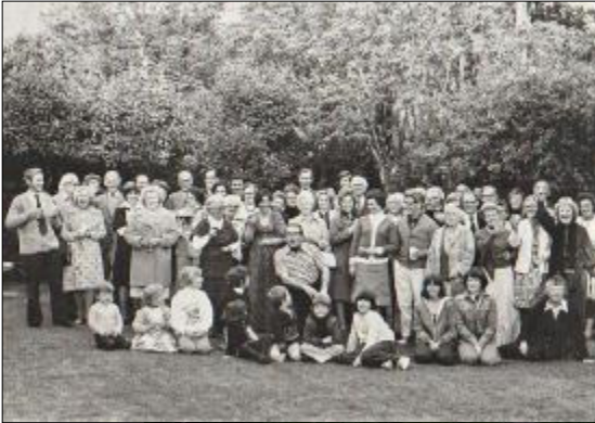
Village gatherings 1 977 (Silver Jubilee – at Regency House), 2002 (Golden Jubilee) 2012 (Diamond Jubilee)