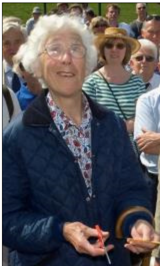
Opening the Playing Field