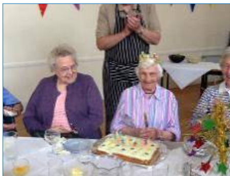
Queen for a day!