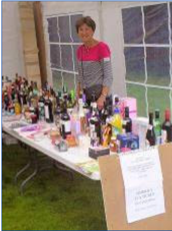
Tombola ticket anyone?