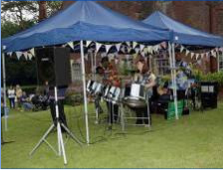
And the band played on .....