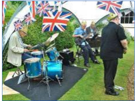
At least we are dry!