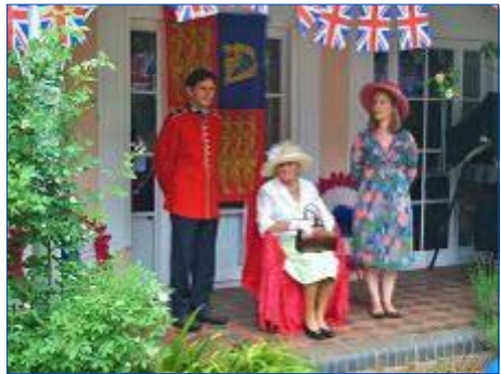
A 'Royal' presence