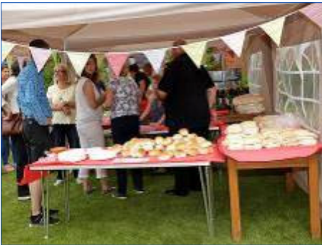
Have we got enough food?