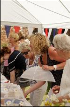
All Hands to Help with Tea