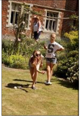
Technique is all-important