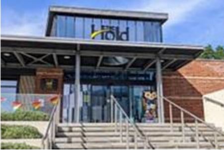
The Hold, Ipswich.

contributions to history. Without that, much could still go unrecorded, and be forgotten. History on a planetary level can be overwhelming. At a local level it remains personal, and can be, indeed will be, fascinating for the generations who will follow us.