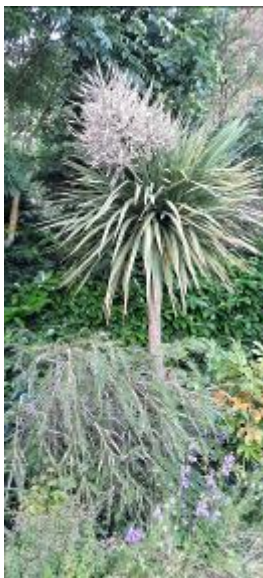
Cordyline Australis-New Zealand Palm.

Note: The Microsoft Word Editor software found 154 spelling mistakes in this piece - so much for Artificial Intelligence!.... Ed