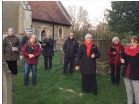
Determination incarnate but wrapped up.