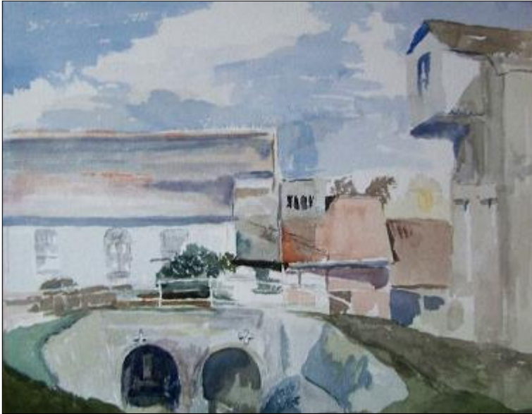
“Wickham Market Mill” by Ron Hurlock

This is just one of the pictures which will be on show at Plant Sale and Fair (details opposite pg.13)