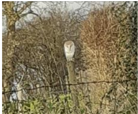
Our local owl, and studio close-up

can remember different vocalisations that prey make and know exactly what they are doing. This gives them a significant advantage while hunting. The prey of barn owls consists of other creatures, some considered to be pests, others more loveable. The menu includes small mammals like rats, mice, bats, rabbits, and other rodents, but also birds like starlings and blackbirds. They can survive in a wide range of habitats – grasslands, fields, marshes, deserts, forests, even suburbs, and cities. Wildlife programmes delight in showing us courtship behaviour. The male barn owl is adept at carrying out a range of mid-air performances, all aimed at impressing the female of the species. Barn Owls are usually monogamous and mate for life.