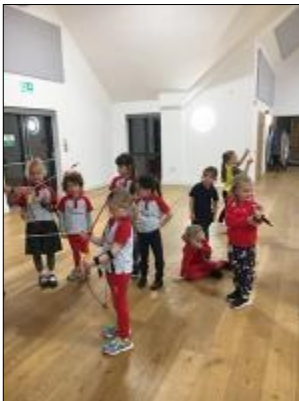
Rainbow – Indoor Archery

If you know any girls between the age of 4 and 7 years old who would be interested in joining Rainbows, we would be delighted to hear from you. You can register on the Girl Guiding website, http://girlguiding.org.uk/register or email us at grundisburghguiding@gmail.com