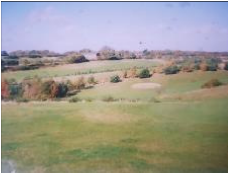
The pictures show the barrenness of the golfscape in the early days and the rich green landscape of today.

Though sharing a name, the Club has never been commercially linked to the Seckford Hall Hotel. It does, however, liaise with local schools. It has some 500 members, and is a major business operation in the parish of Great Bealings. It is a Club whose achievements deserve to be locally celebrated.