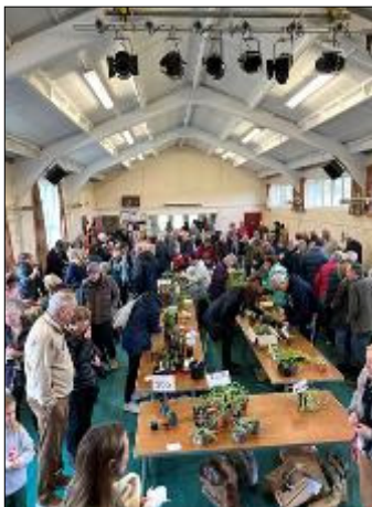
Plant Sale 2024 – a crowded Village Hall

Bring your family, friends, and a love of gardening to the Bealings Spring Plant Sale. Mark your calendars, we can't wait to see you there!