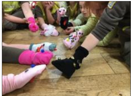
Brownie Sock Puppets

If you know any girls between the age of 7 and 10 years old who would be interested in joining Brownies, we would be delighted to hear from you. You can register on the Girl Guiding website, http://girlguiding.org.uk/register or email us at grundisburghguiding@gmail.com