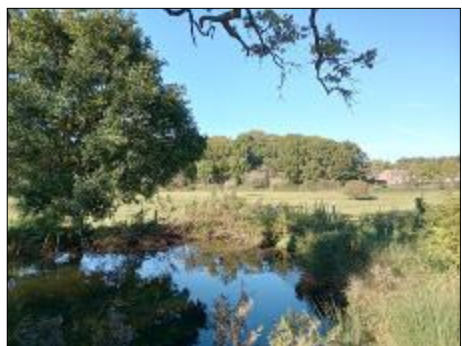
The Water Meadow